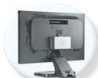
HP LE1851 wt Monitor with HP t150 mounted