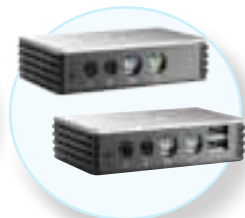
HP t100 or t150 Zero Client for MultiSeat