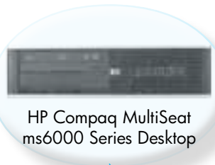
HP Compaq MultiSeat ms6000 Series Desktop

Get more seats with a shared resource computing solution from HP.